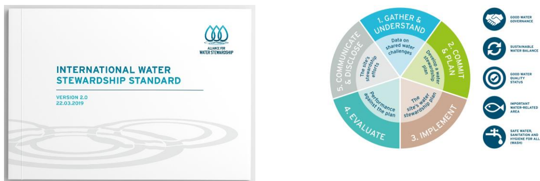
Figure 2: The AWS Standard and its five steps and five outcomes.

The AWS Standard is applicable globally to all organizations and industrial sectors, independent of their size and operational complexity. The focus of the Standard is the operational site and its local water catchment, but with a broader goal to include indirect water use in the supply chain. The Standard applies to all types of water used by an organization in its normal activities. This includes surface water, groundwater, recycled water, desalinated water (from ocean or brackish sources), precipitation, non-renewable reserves (fossil water), and even unusual sources such as snow or ice. The scope applies to all water uses whether from private water sources or from third party suppliers. The same applies to wastewater management and treatment.